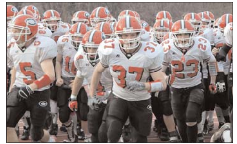
Walter Camp Football Foundation Connecticut Team of the Year

1976 -- Fitch 1977 -- Trumbull 1978 -- Amity 1979 -- Newington 1980 -- Trumbull 1981 -- Naugatuck 1982 -- St. Joseph 1983 -- Ansonia 1984 -- Middletown 1985 -- Hillhouse 1986 -- Trumbull 1987 -- East Catholic 1988 -- Stratford 1989 -- Ansonia 1990 -- Derby 1991 -- Notre Dame-W. Haven 1992 -- Cheshire 1993 -- Cheshire 1994 -- Cheshire 1995 -- Cheshire 1996 -- Weaver 1997 -- Hand 1998 -- Bloomfield 1999 -- Bloomfield 2000 -- Fitch 2001 -- New Britain 2002 -- West Haven 2003 -- New Britain 2004 -- Hand 2005 -- Xavier 2006 -- Ansonia 2007 -- Ansonia 2009 -- Notre Dame-West Haven 2010 -- Xavier 2011 -- Xavier 2012 -- Hand 2013 -- Ansonia