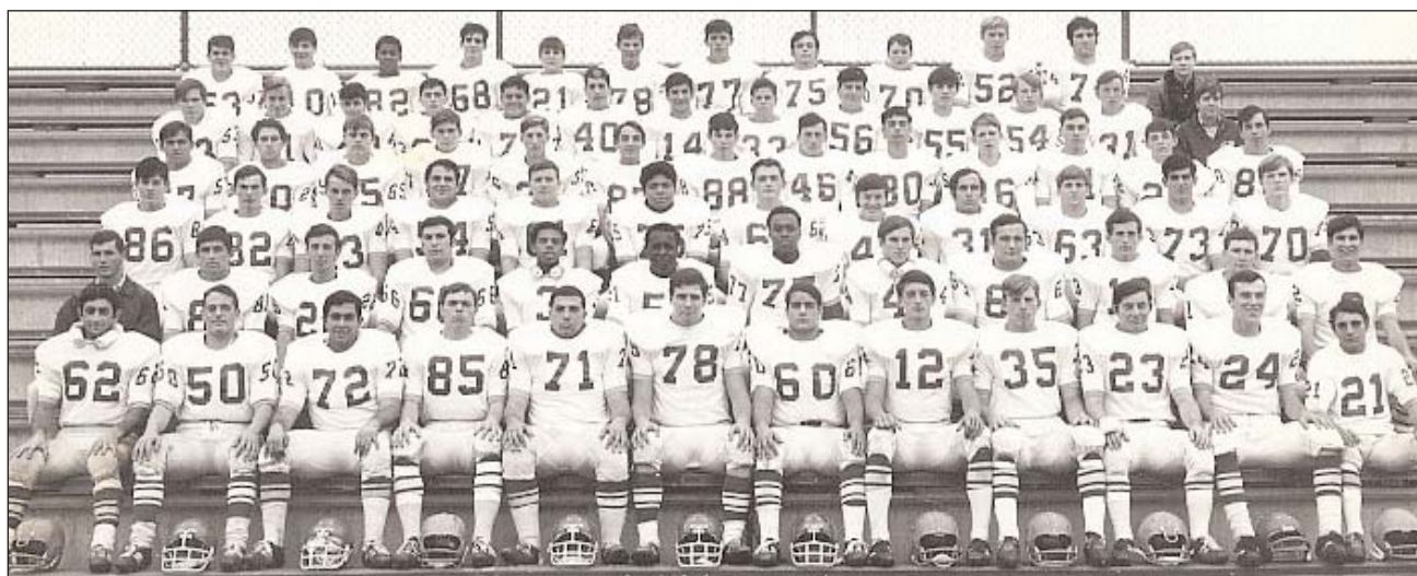
The undefeated 1968 West Haven High football team was voted No. 1 in the New Haven Register poll with a 9-0 record. The National Sports News Service ranked West Haven fifth in the country.