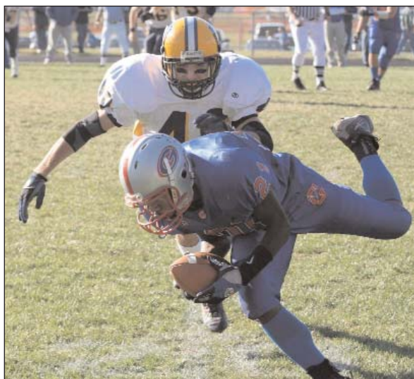
Simsbury Gridiron Club